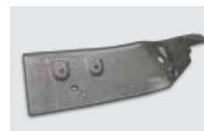
Presshardened steel for body-in-white