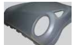
Interior plastic components