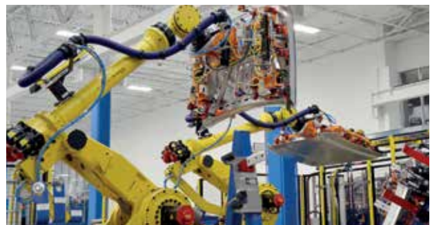
Automated production line for car body assembly