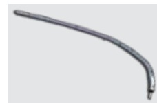
3D shaped tubes