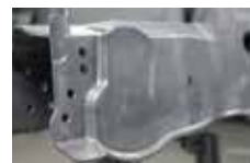
Aluminium light-weight parts