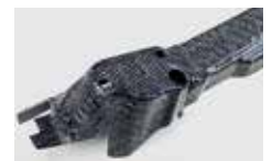
CFRP carbon fiber reinforced plastics