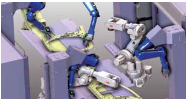
Customized multi robot solution

Beyond laser cutting our extended know how in the field of customized automation will benefit you with tailored robotized solutions for material processing needs like welding, hemming, gluing, riveting and other joining technologies. A clear focus on fully line integrated systems, maximum throughput paired with highest flexibility is our driving factor for your next project.