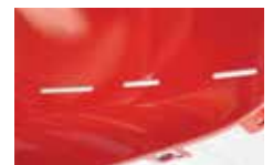
Exterior plastic parts